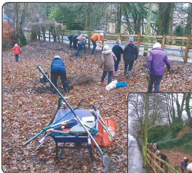
A damp January morning was filled with chatter and planting when the Euxton WI Hedgerow team took to renewing the hedgeline on Wigan Road at Chapel Brook

We planted two rows of Hawthorn. Each plant one boot length apart and the same for the two rows, with the saplings staggered. The shoring up of the banking with soil which Euxton Council had done prior was helpful to ensure the new saplings had room to grow.