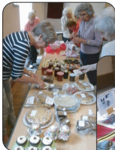
Left: Super puddings