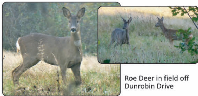
Roe Deer in field off Dunrobin Drive