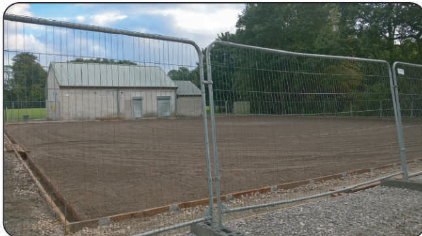
Two photos from the construction stages - there are many stage photos on the Parish Council website in the photo gallery