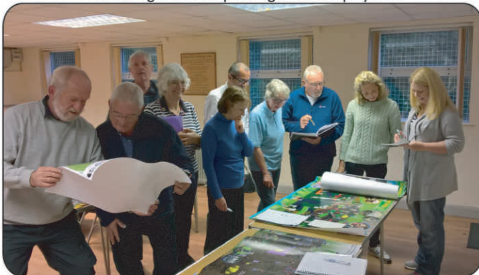
Below: Public consultation session on 27 September - some residents viewing the designs