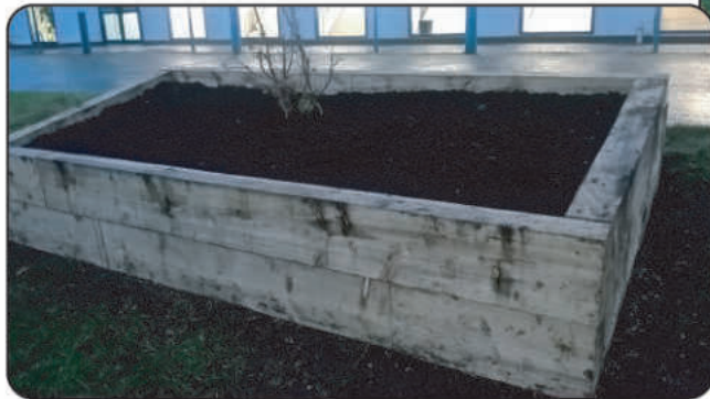
Above: Replacement bed at the Tile Centres in the middle of the village and below the replacement at 'Euxton Junction'