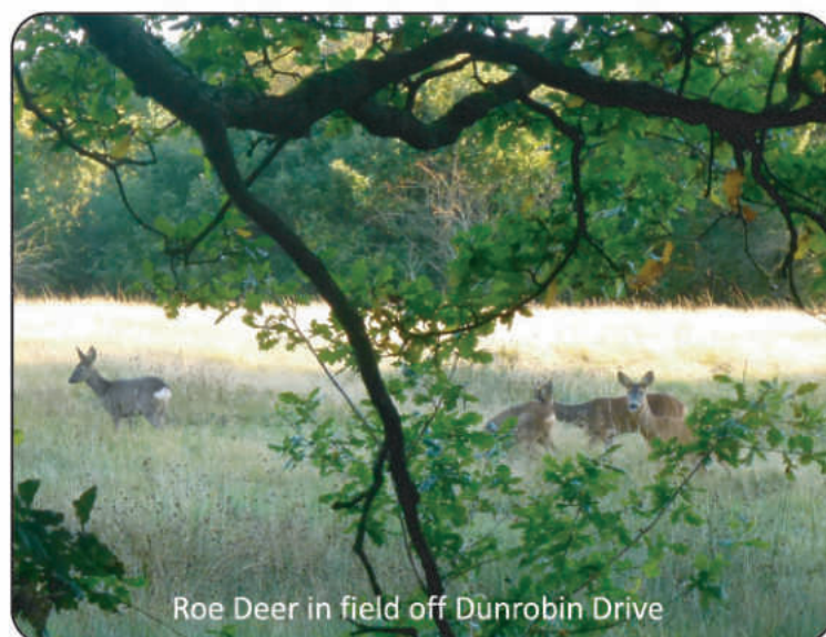
Roe Deer in field off Dunrobin Drive

Shortly before the inquiry Gladman secured the agreement of Lancashire County Council (the Highway Authority) to their proposals and I think the inspector regarded the topic as cut and dried. My evidence was all about the impact of traffic from the site on the surrounding roads and pedestrians and the poor quality of road and footpath connections to the site. I think I succeeded in persuading her that there was plenty wrong with the agreement and that she couldn't just dismiss the highways issues. Whether I am right and, if I am, whether it will be of any great significance in the greater scheme of things, we shall see.