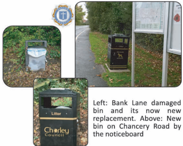
Left: Bank Lane damaged bin and its now new replacement. Above: New bin on Chancery Road by the noticeboard