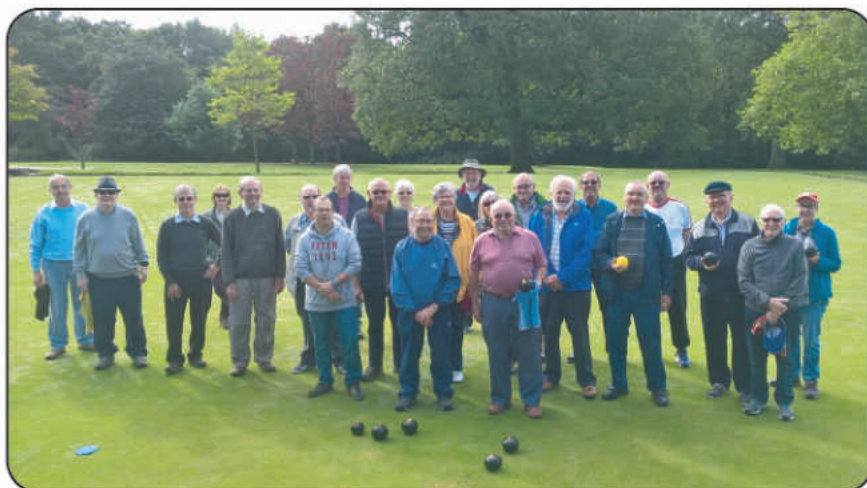
The last taster session attended by many Euxton residents held on Astley Park