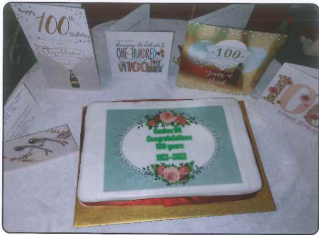
Above: photo of the celebration cake