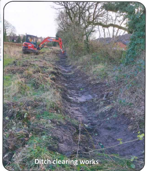
Ditch clearing works