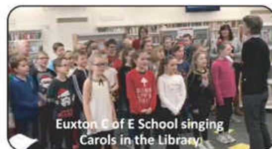
Euxton C of E School singing Carols in the Library