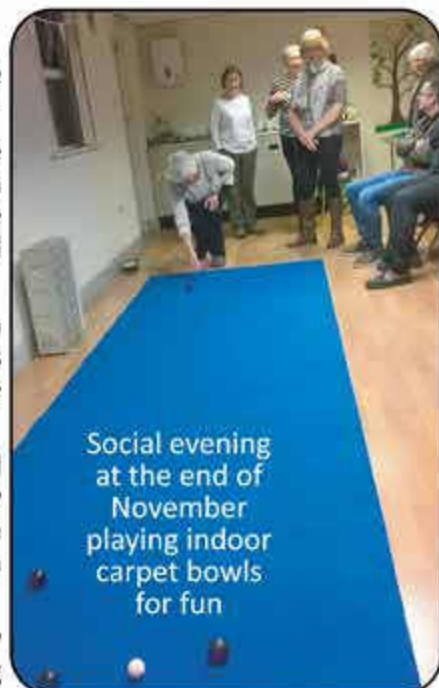
Social evening at the end of November playing indoor carpet bowls for fun

Good Luck to all bowlers in the new season!