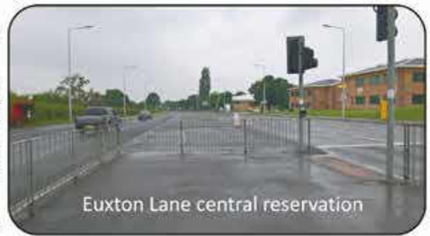
Euxton Lane central reservation