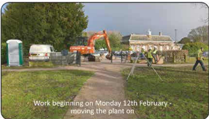
Work beginning on Monday 12th February - moving the plant on