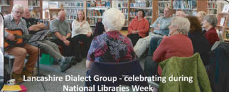
Lancashire Dialect Group - celebrating during National Libraries Week