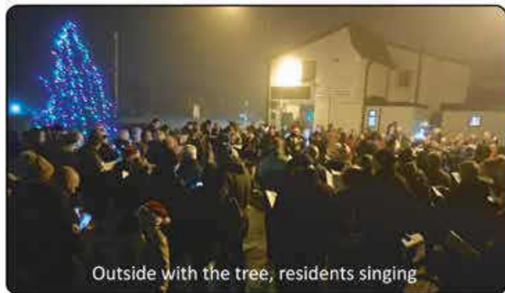
Outside with the tree, residents singing