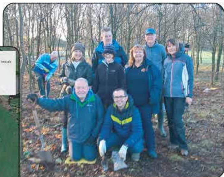
6000 bulbs planted by volunteers one cold Friday morning