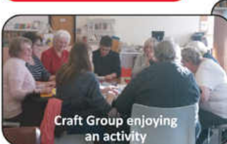
Craft Group enjoying an activity