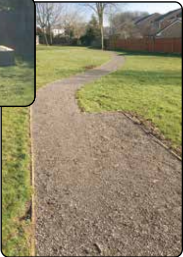
Raised beds above, one more to be built, and right, the path where the seats will be installed