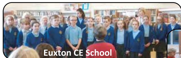
Euxton CE School