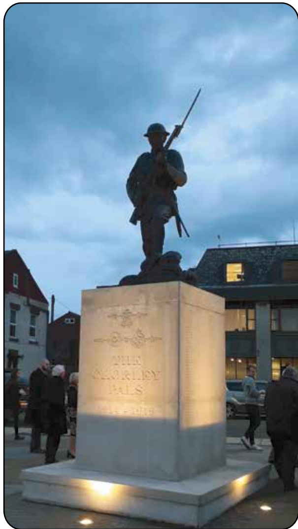
Chorley Pals statue illuminated

Poppy arch made at Euxton CE Primary School and Wreath made by children at Busy Bodies nursery