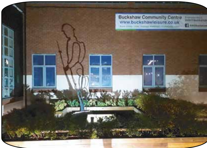
'Tommy' outside Buckshaw Community Centre