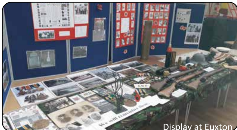
Display at Euxton Methodist Church