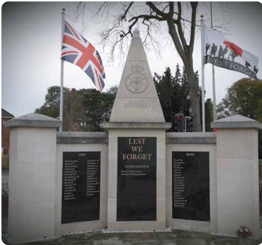
Euxton War Memorial