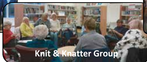
Knit & Knatter Group