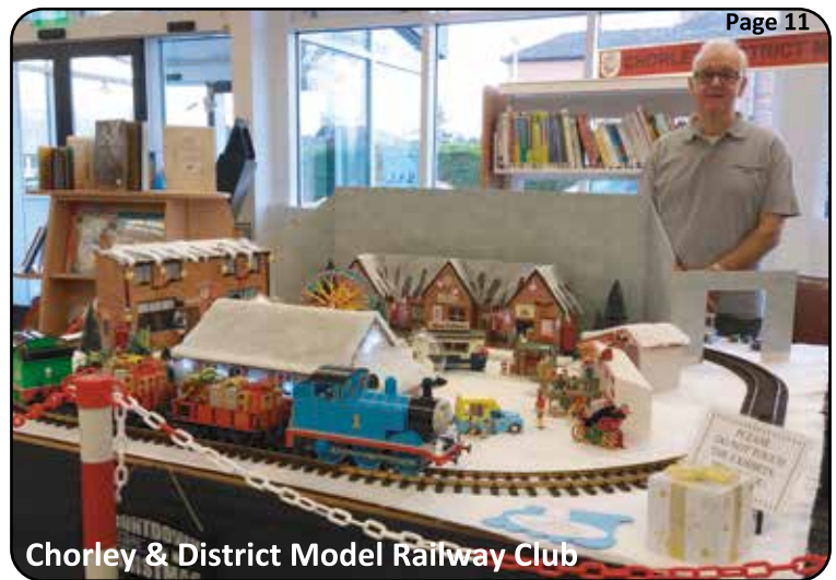
Chorley & District Model Railway Club

Friday 17th May Knit & Natter 2:00 - 4:00 "Come and join us - beginners welcome!"