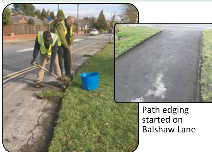
Path edging started on Balshaw Lane

If you need assistance with a map for an area, let the Clerk know and she can send one to you. Or if you require a paper copy of the form.