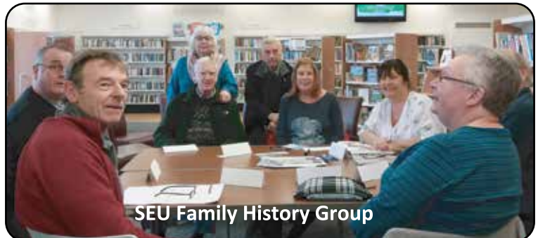
SEU Family History Group