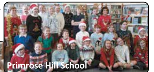
Primrose Hill School