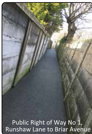
Public Right of Way No 1, Runshaw Lane to Briar Avenue

A down side to making improvements is a mindless few residents who think they can do better. A 'cut' fence was repaired one day and sawed off again another. This was stopped up by order of the land owner because it goes through their land which is not safe for walkers, a safe route has been created by the land owner of PROW 43 which