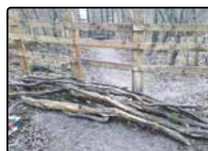
Repaired left, vandalised on purpose soon after, right

comes out further down the perimeter fence line of the Millennium Green. If you know who did this, report them as it is time wasting, money wasting and puts walkers and their dogs in danger, the land has dangerous broken metal fence parts sticking out of the ground.