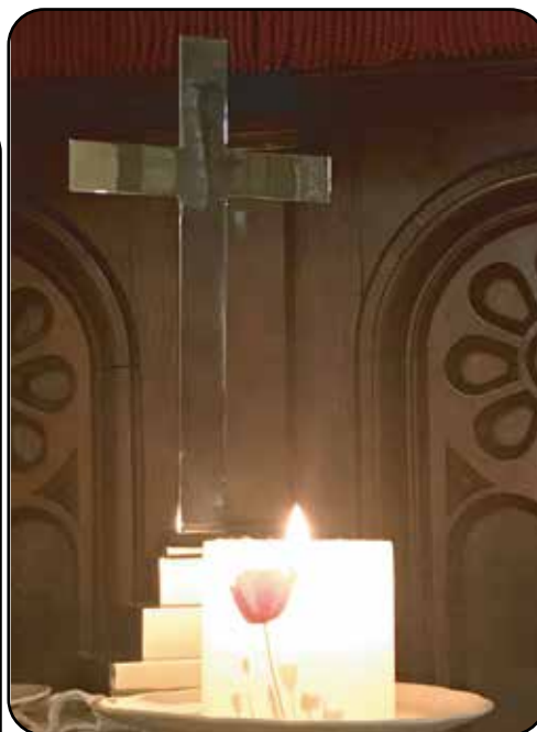
Candles relit at the 2018 "Lights On" service