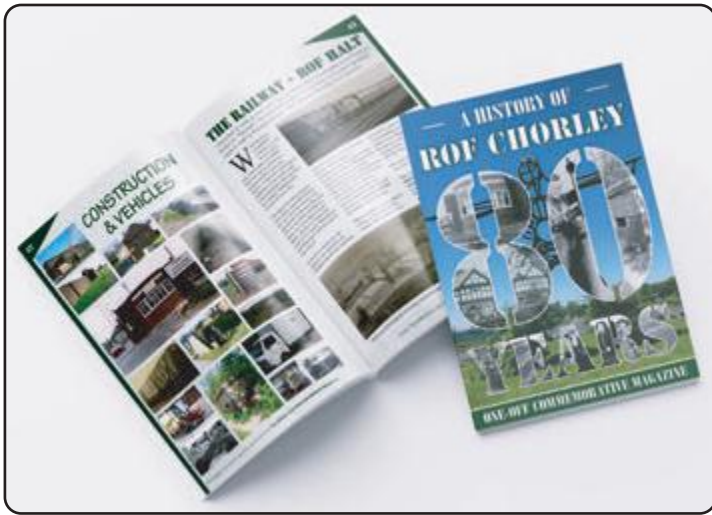
ROF Chorley magazine cover page