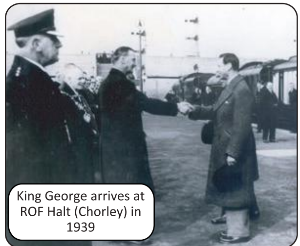
King George arrives at ROF Halt (Chorley) in 1939