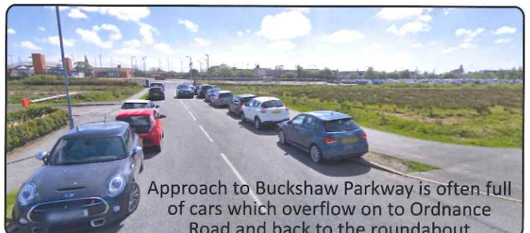
Approach to Buckshaw Parkway is often full of cars which overflow on to Ordnance Road and back to the roundabout