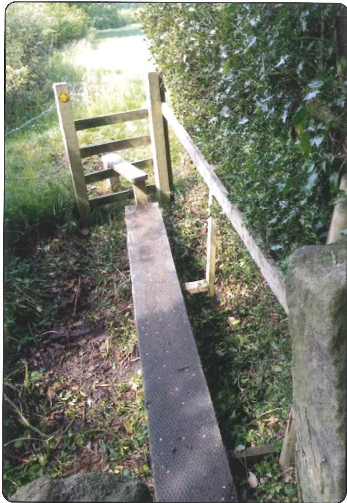
Above, a PROW stile bridge, which was very slippery, was covered with wire mesh to help to make the surface less slippery and the rail and stile repaired.