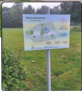
There are four boards, one at each of the four entrances to the Millennium Green