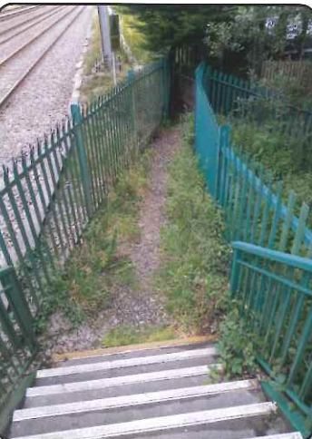
Left is the before and below is the after photo of PROW 20 which goes over the railway from the rear of Euxton Parish Church cemetery heading to The Cherries - this was re-stoned and weeded.