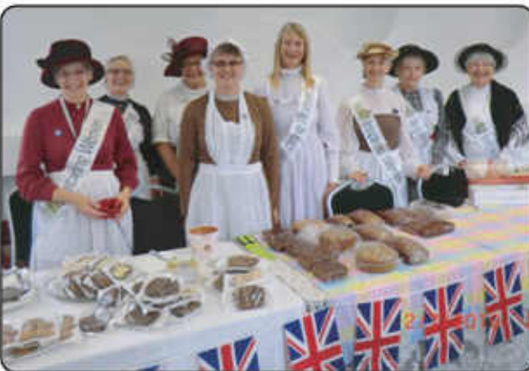
Photo: Buckshaw WI Members at Astley Park for the Somme 100 event, suitably dressed for the occasion