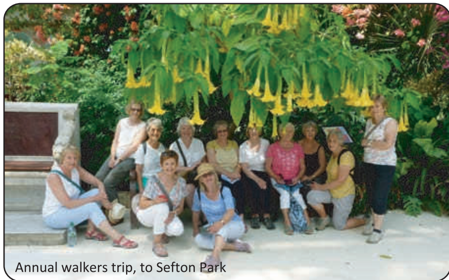
Annual walkers trip, to Sefton Park