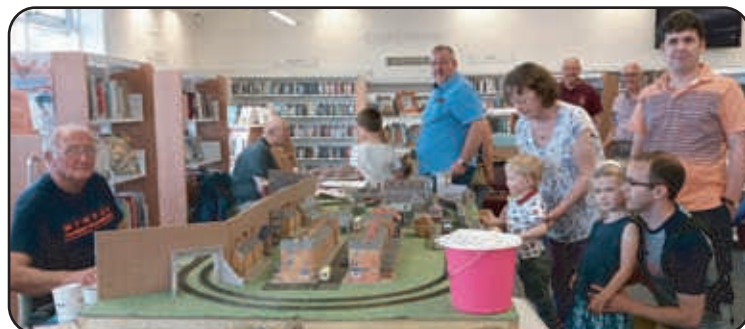
Photograph of the Chorley & District Model Railway Club in July

'Euxton Art & Craft Group' meet 2nd & 4th Wednesday in the month - 1:30-3:30 pm