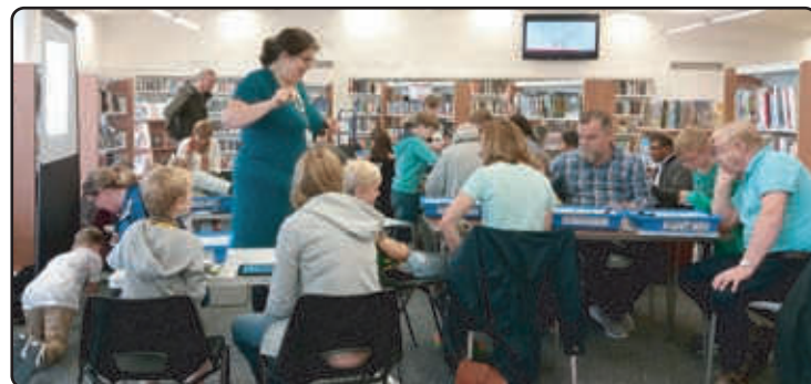
Lancashire College - Lego Robotics